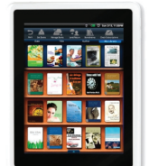
PanDigital® Novel with firmware update