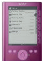
Sony Reader Pocket Edition™