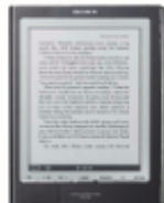
Sony Reader PRS-700 with v1.1 (or newer) firmware