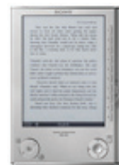
Sony Reader PRS-505 with v1.1 (or newer) firmware