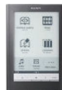
Sony Reader Touch Edition™