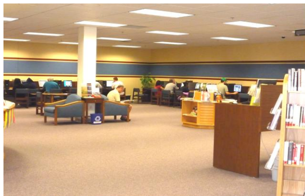
Marathon County Public Library – Wausau, 2 nd Floor

These decorating changes have garnered many positive comments from both customers and staff. Everyone, it seems, likes the friendlier look.